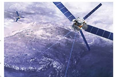
Aerospace & Satellite Imaging

All SmartLF scanners are available in three affordable specification levels: monochrome, color and express color, (m, c, e). m and c models can be easily upgraded via unique email process if requirements change.